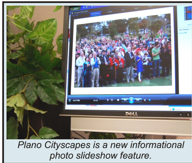
Plano Cityscapes is a new informational photo slideshow feature.